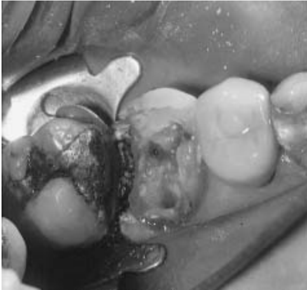
Fig 3. Isolation of an upper first molar tooth using the rubber dam 'cuff technique'.

excluded in order to eliminate these factors as potential causes of the pulp and periapical diseases.