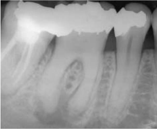
Fig. 4 Tooth 46 – Periapical radiograph of the only tooth in the study that did not have caries, cracks or marginal breakdown evident when the existing restoration was removed. However, the restoration had been replaced only eight months prior to being examined as part of the current study.

periapical disease, even when they were examined under ideal viewing conditions. Caries was noted from the radiographs in only 47 (19.2 per cent) teeth but examination after restoration removal showed that 211 (86.1 per cent) teeth actually had caries. Bitewing radiographs may have been of more value in detecting caries but they are not routinely recommended or taken by endodontists as part of an endodontic examination except where there is any doubt about the diagnosis prior to initiating treatment. The results of this study suggest that bitewing films may need to be taken more often when assessing pulp and periapical diseases. The other factors examined in this study (marginal breakdown and cracks) can not be detected radiographically and hence they were not assessed in this part of the study.