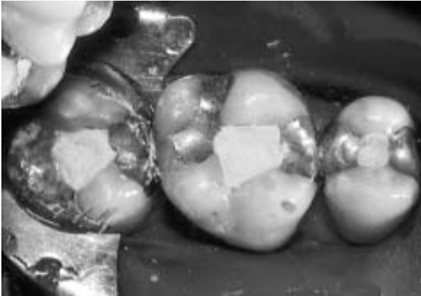
Fig 1. Three teeth with traditional access cavities cut through the existing amalgam restorations.

combined), or should the tooth be extracted? In some cases, it may even be a question of whether endodontic treatment is required since not all pulp diseases need to be treated in this manner – e.g., reversible pulpitis can usually be managed with simple restorative procedures after removing the irritant that is causing the pulp inflammation.